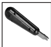
Punch-down Connecting Tool