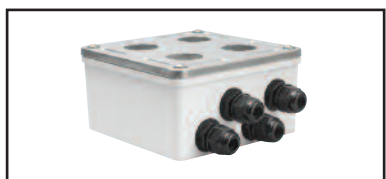
IP67 Surface Mount Box