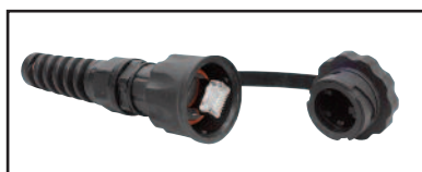
IP67 Plug Kit